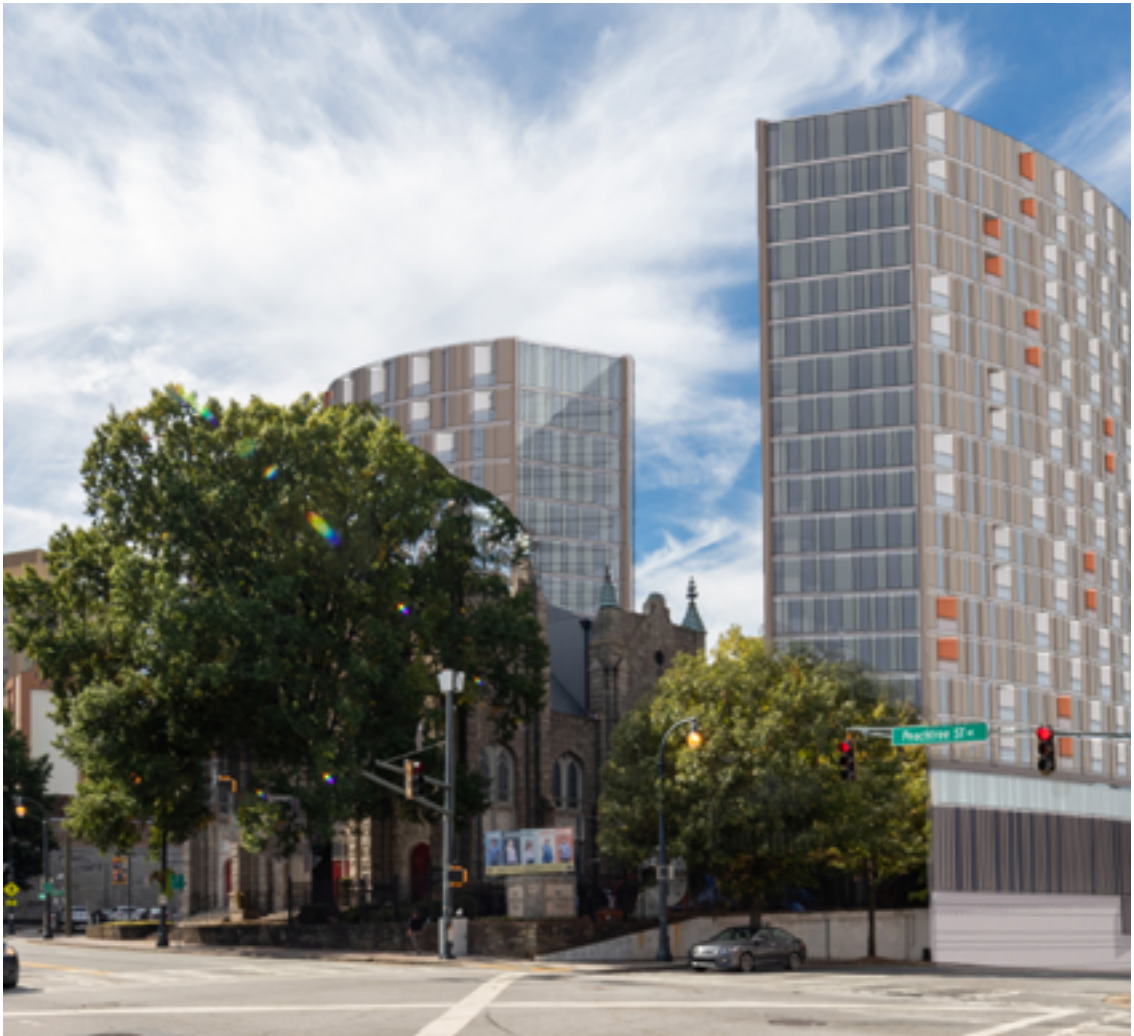
PEACHTREE STREET AND IVAN ALLEN JR BLVD